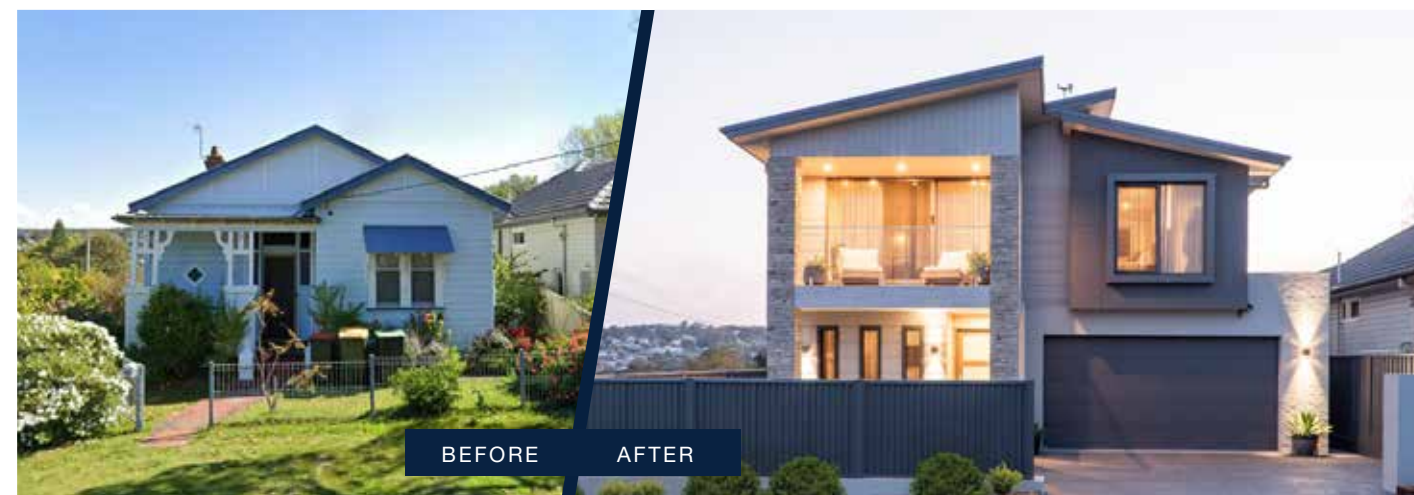
Byron 292 | Retro Facade