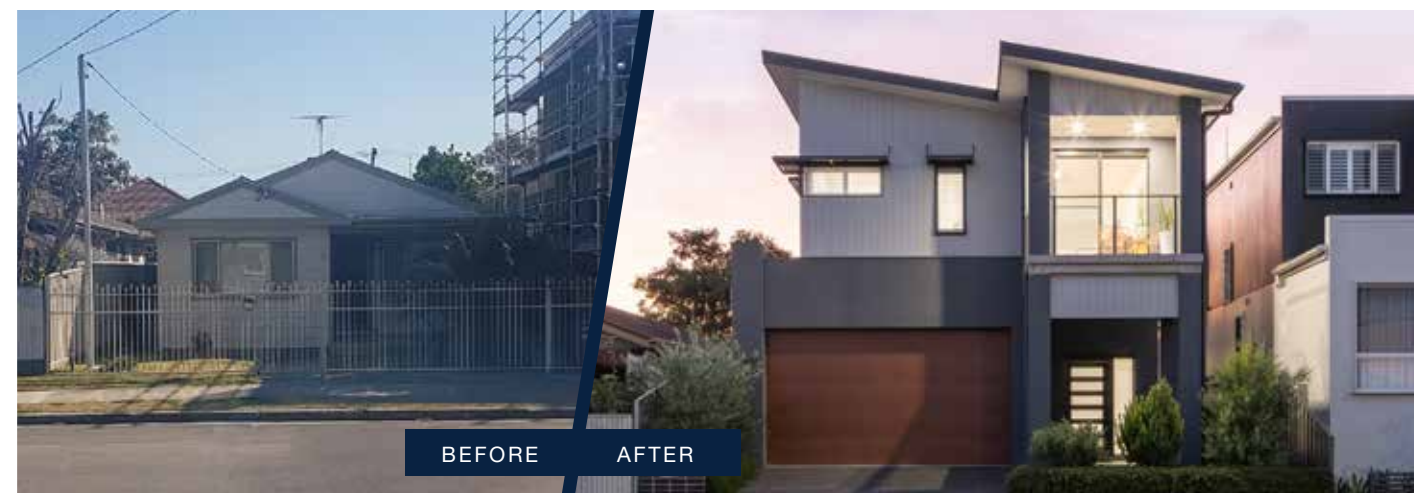
Coolum 266 | Retrp Facade