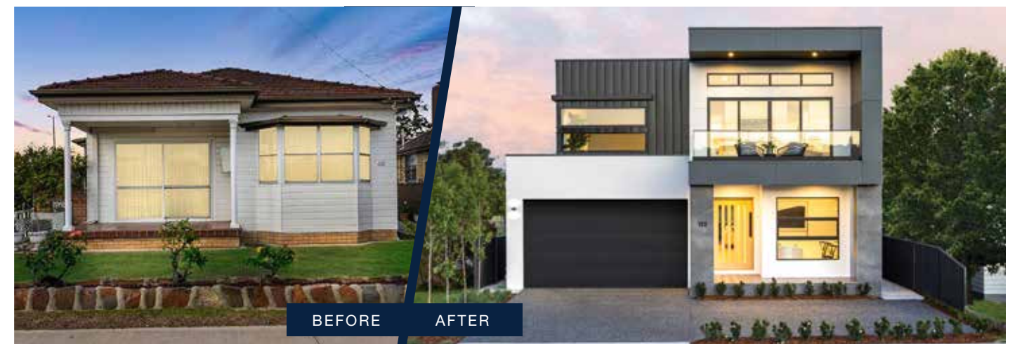
Cayman 287 | Manhattan Facade