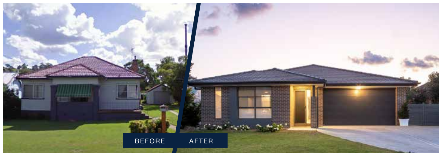
Avalon 211 | Metro Facade

Take a look at some of our incredible completed knockdown rebuilds: