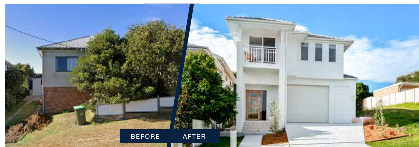
Coolum 266 | Executive Facade