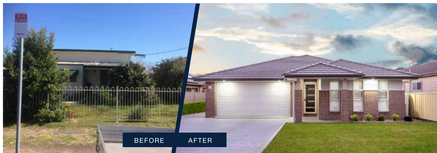
Bondi 220 | Metro Facade