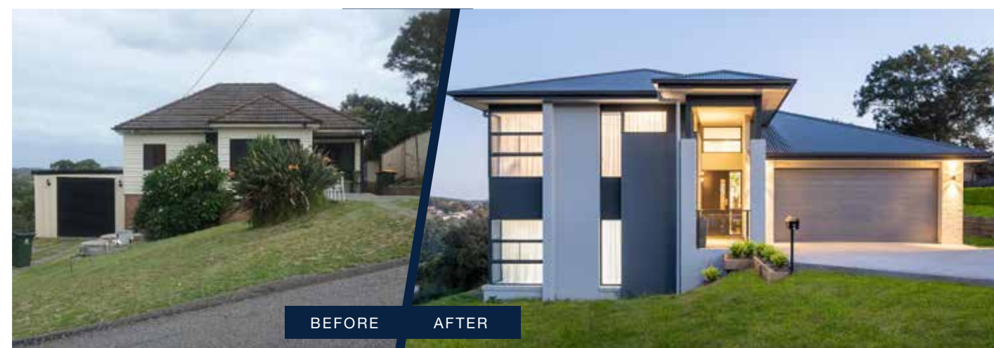
San Remo 273 | Executive Facade