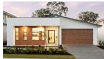
Airlie 1 245

7 Peachy Avenue, Huntlee (North Rothbury) Open 7 days: 10am - 5pm