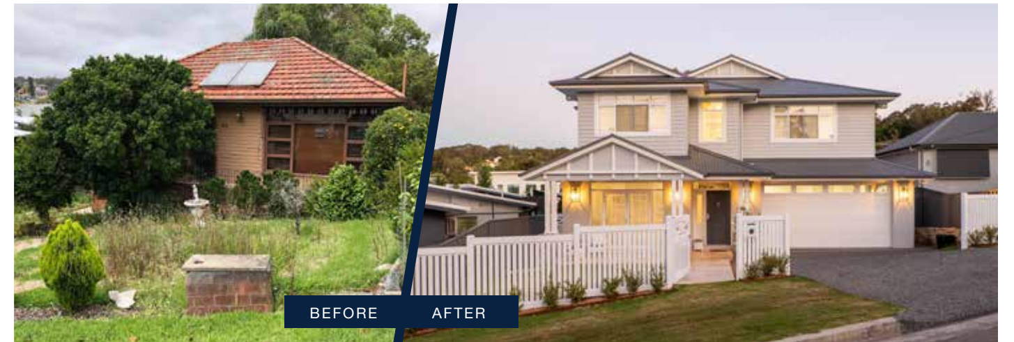
Byron 295 | Hamptons Facade