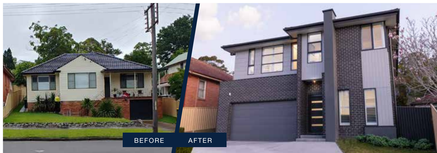
Byron 250 | Metro Facade