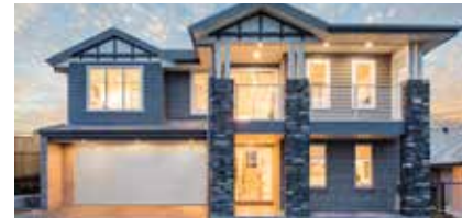
Riviera 1 267

303 The Boulevard Miranda Open 7 days: 10am - 5pm