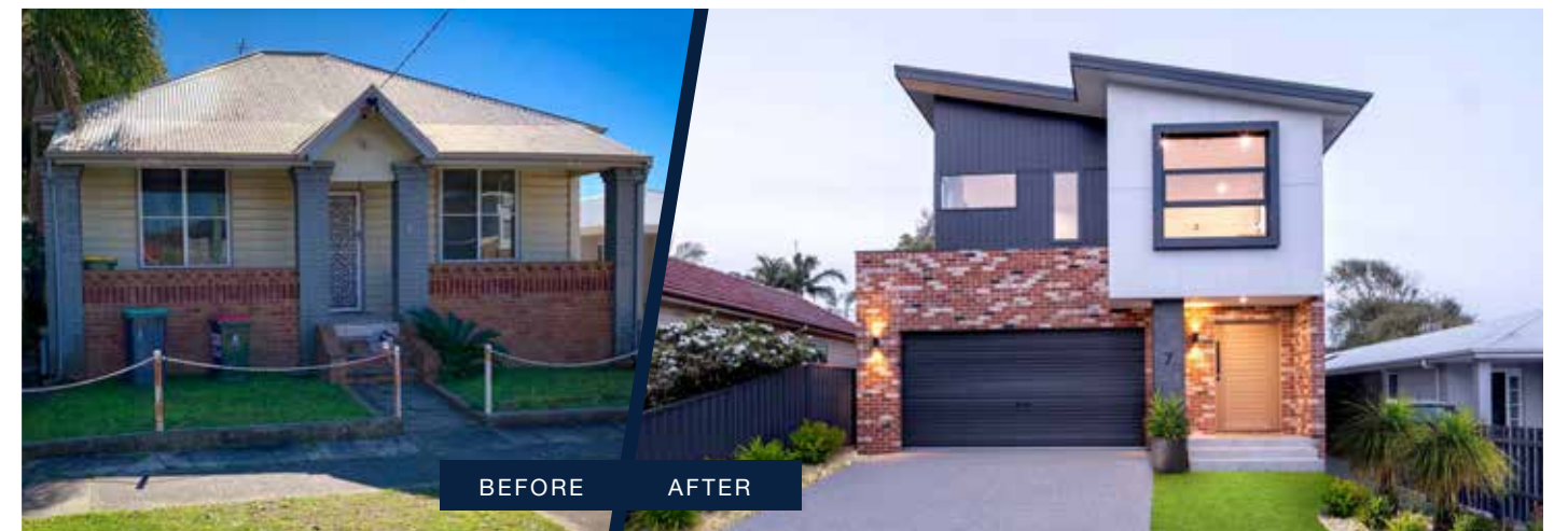
Coolum 266 | Retro Facade