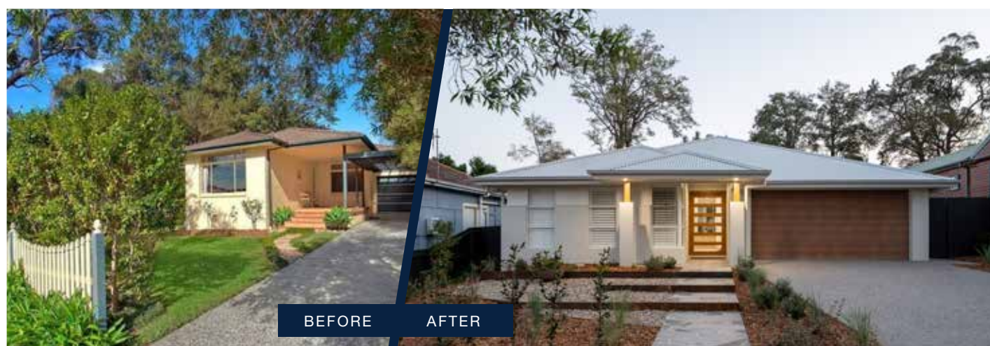
Bondi 249 | Cosmo Facade