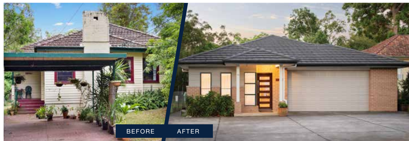
Bronte 222 | Cosmo Facade