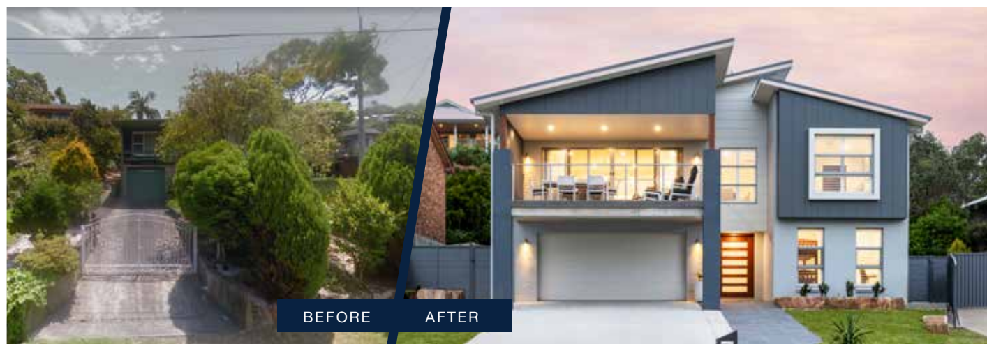
Riviera 2 293 | Retro Facade

Take a look at some of our incredible completed knockdown rebuilds: