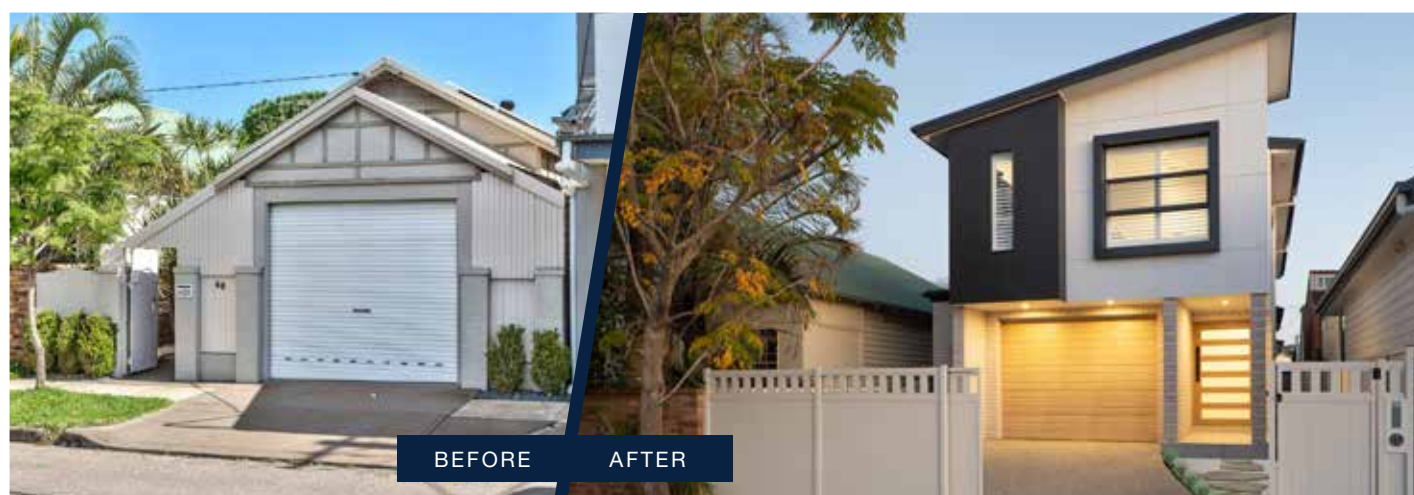
Malibu 208 | Retro Facade