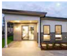
+ Granny Flat