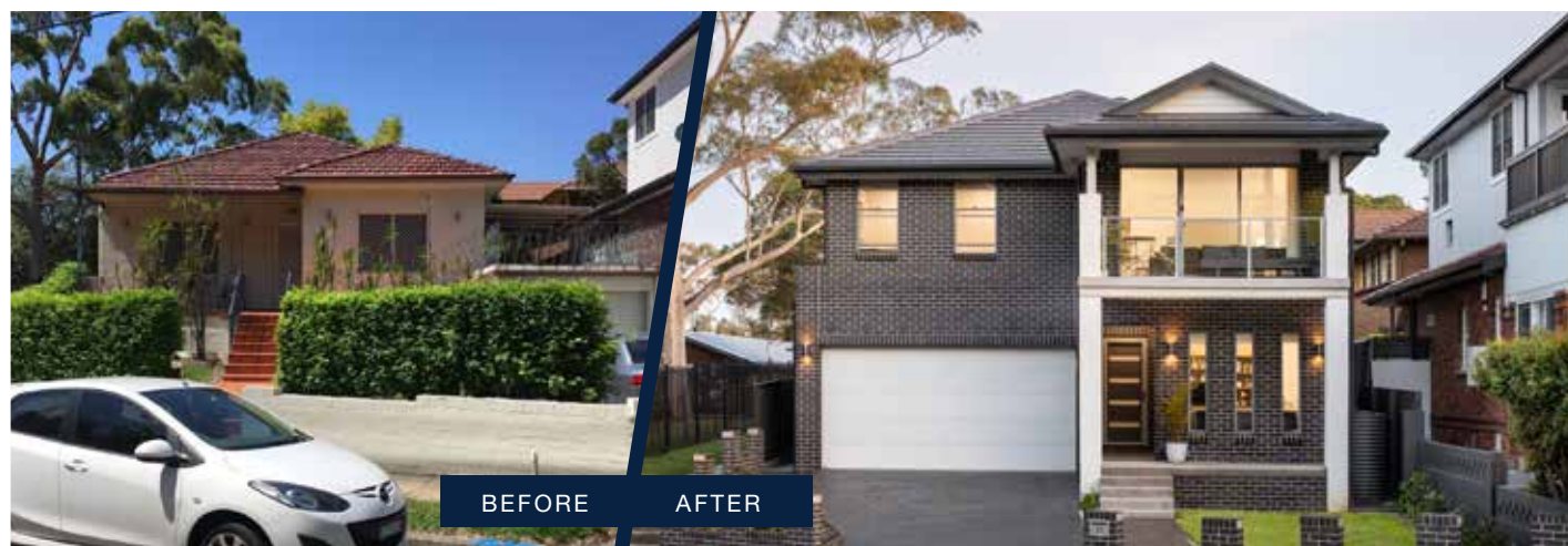
Byron 250 | Executive Facade

Take a look at some of our incredible completed knockdown rebuilds: