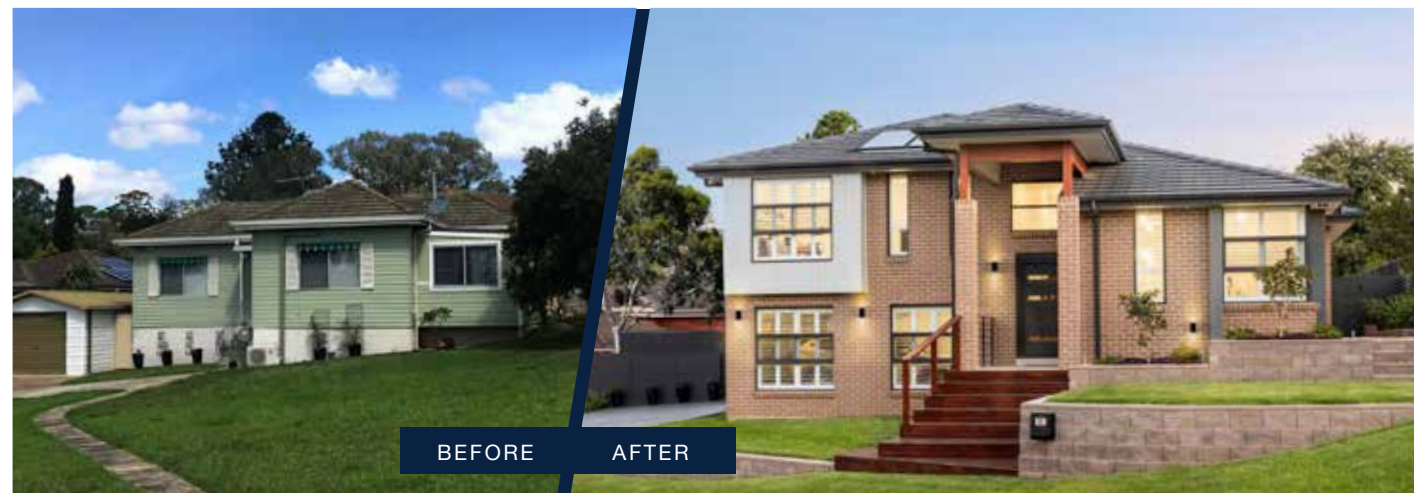
San Tropez 271 | Executive Facade