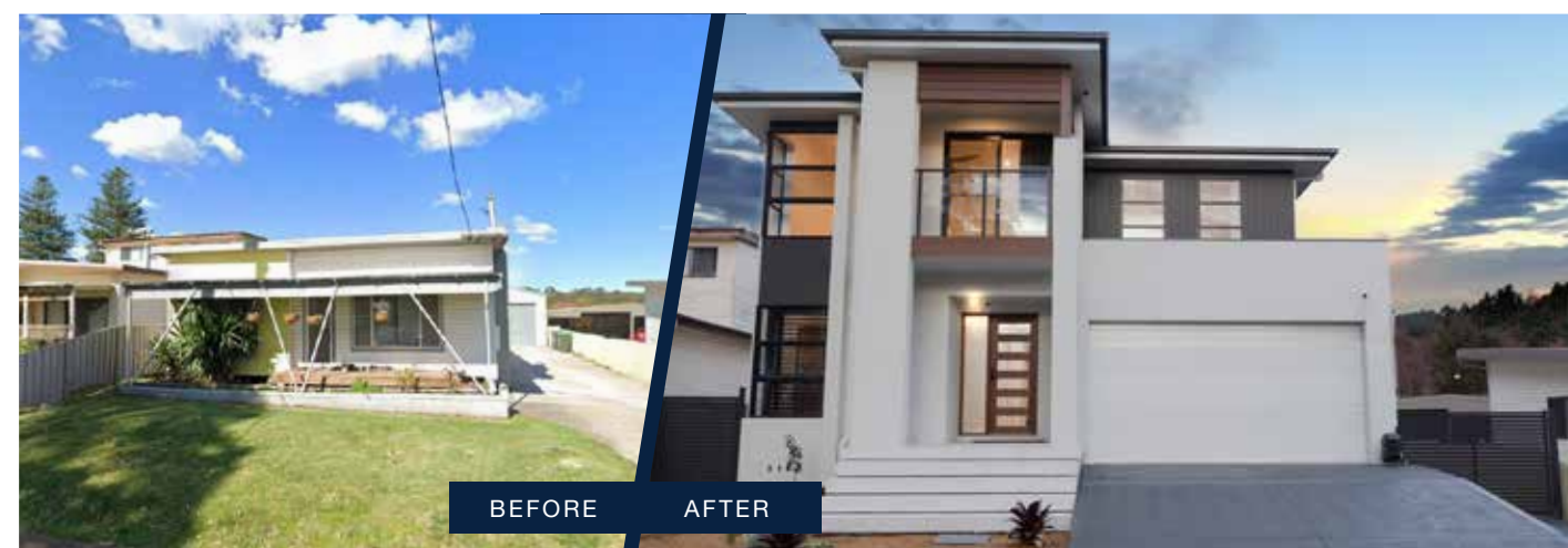
Cayman 249 | Executive Facade