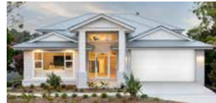
Carolina 2 281