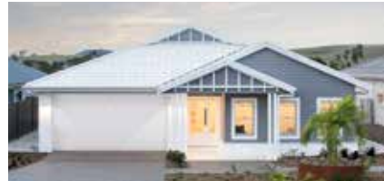
Avalon 2 249

122 Bridges Road New Lambton Open 7 days: 10am - 5pm