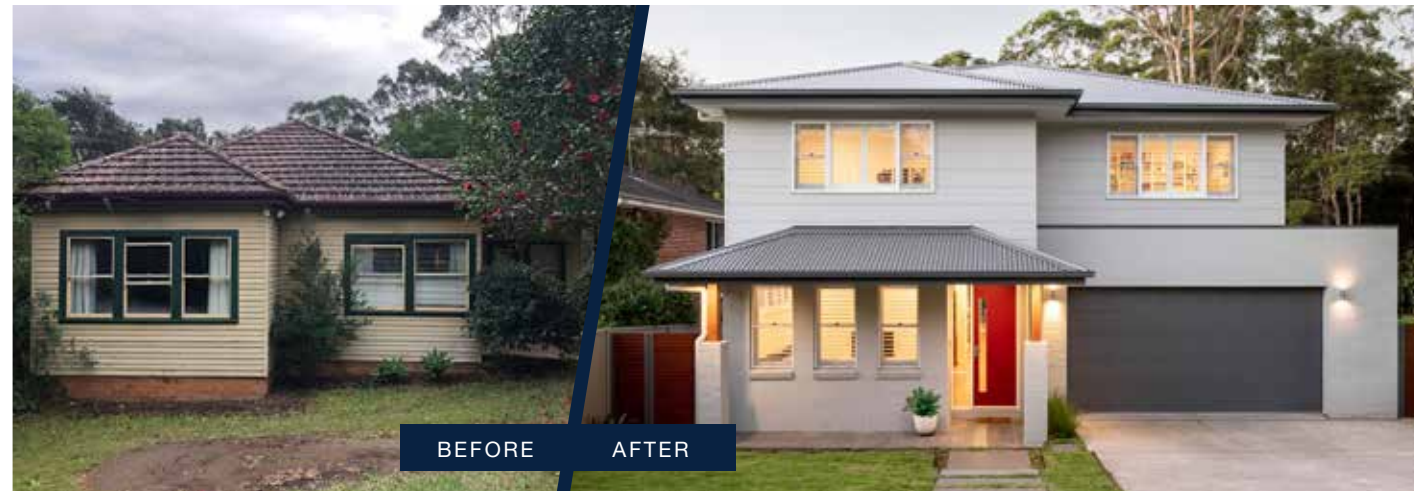
Byron 295 | Metro Facade

Montgomery Homes are experts at knockdown rebuilds on all types of sites — including narrow, level and sloping blocks. Take a look at some of our incredible completed knockdown rebuilds: