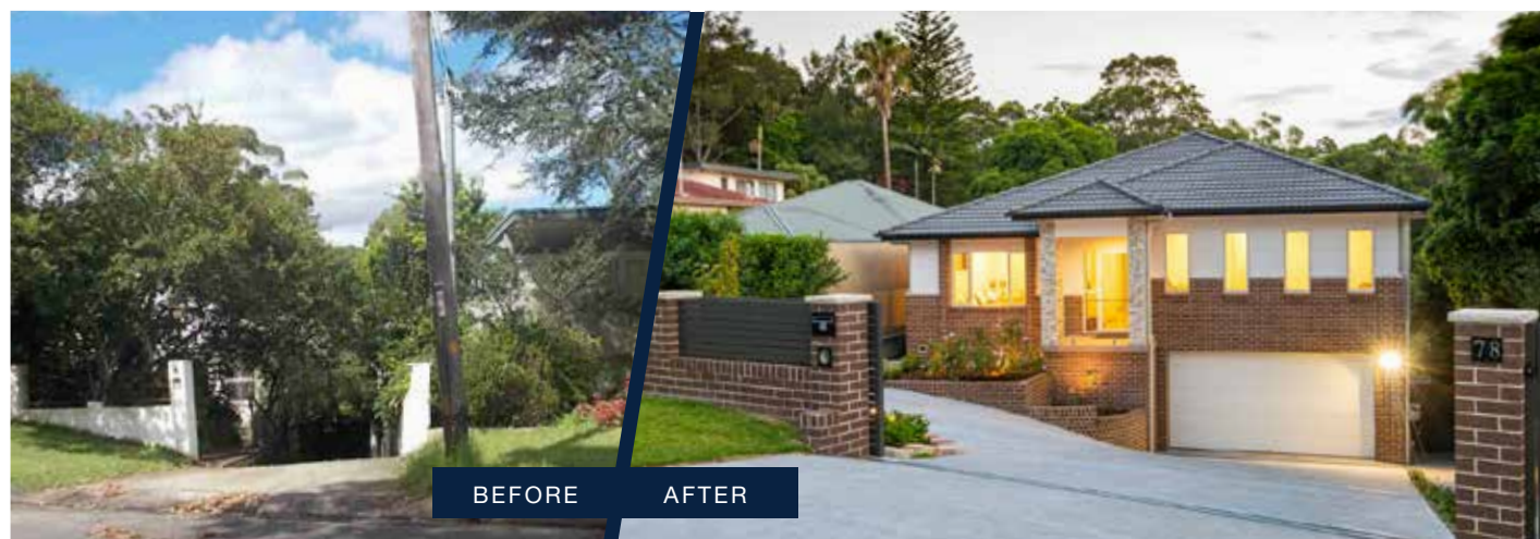
San Tropez 243 | Metro Facade