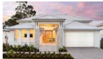
Carolina 1 311

Hunter HomeWorld 49 Kingham Circuit, Thornton Open 7 days: 10am - 5pm