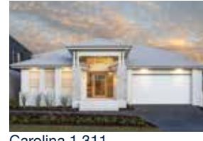
Carolina 1 311

HomeWorld 22 Ellison Street Open 7 days: 10am - 5pm