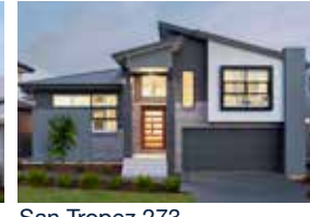
San Tropez 273