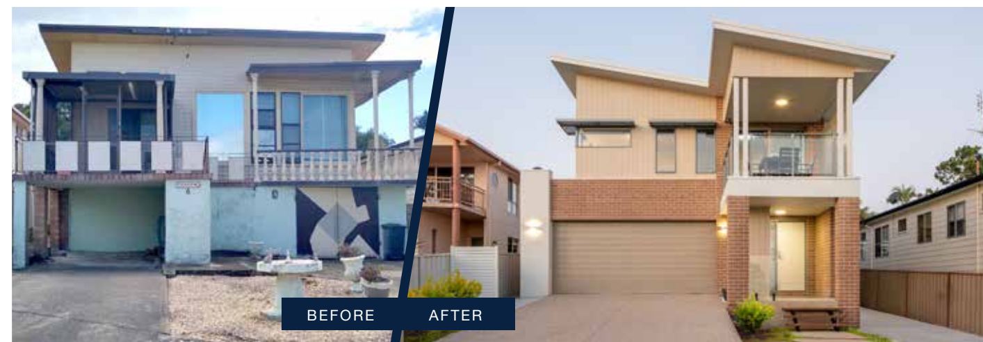
Coolum 266 | Retro Facade