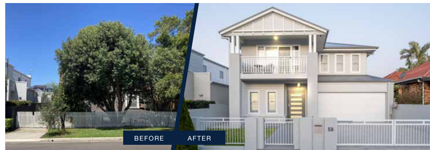
Cayman 349 | Hamptons Facade