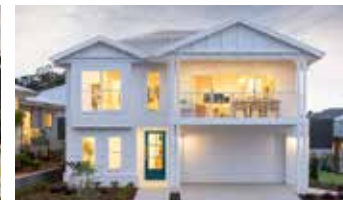
Riviera 2 264