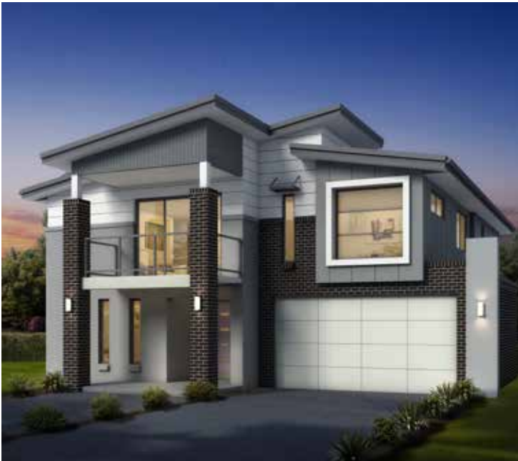
Retro Facade Roof Type Tiles Total m 2 /Sq 268.76/28.9