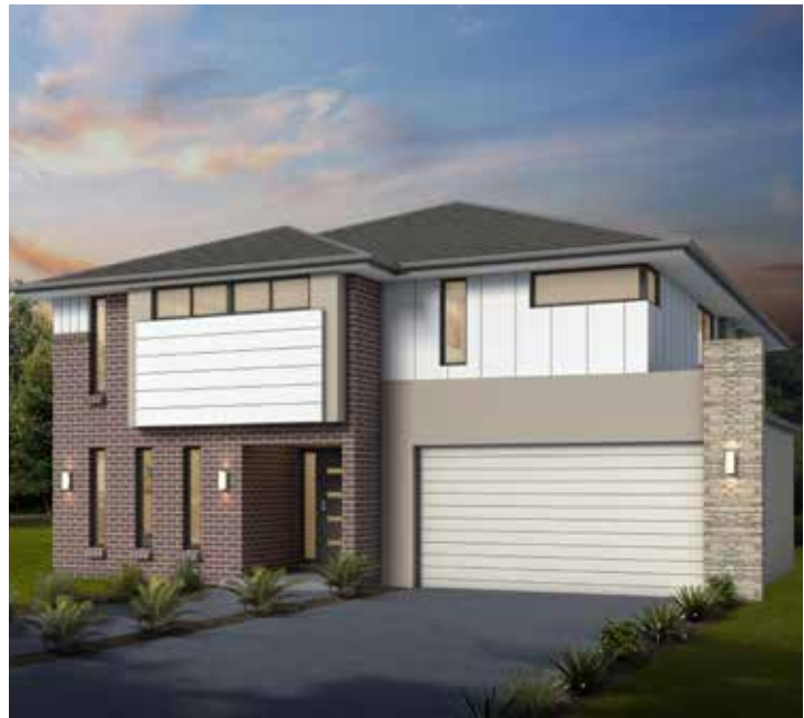
Metro Facade Roof Type Tiles Total m 2 /Sq 262.62/28.3