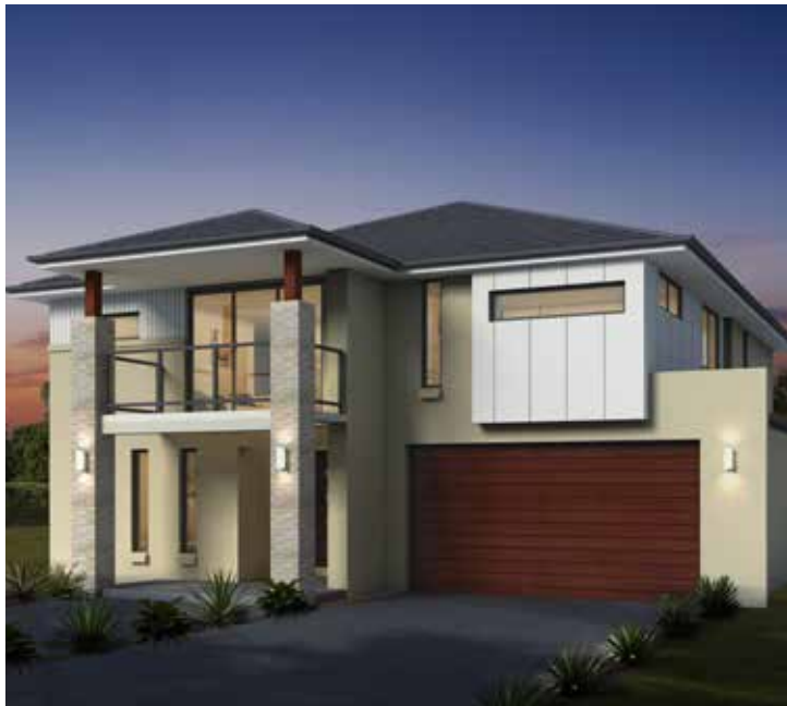
Executive Facade Roof Type Colorbond Total m 2 /Sq 268.64/28.9