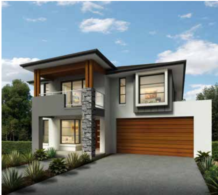
Grande Facade Roof Type Colorbond Total m 2 /Sq 270.17/29.0