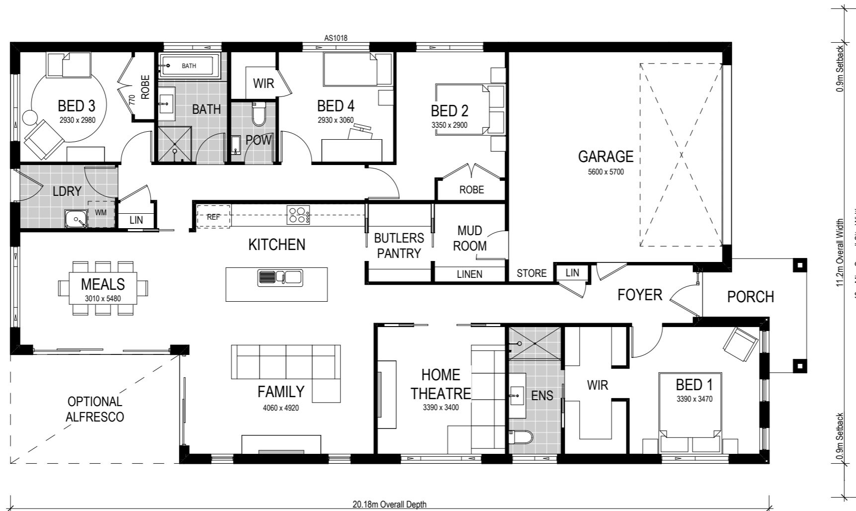
Scale: 1:100. Floor plan depicts Hamptons facade.