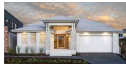
Carolina 1 311

13 Yobarnie Avenue North Richmond Open 7 days: 10am - 5pm