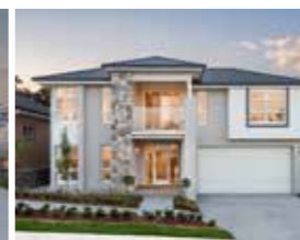
Riviera 1 262