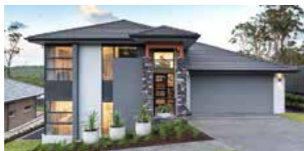
San Remo 273