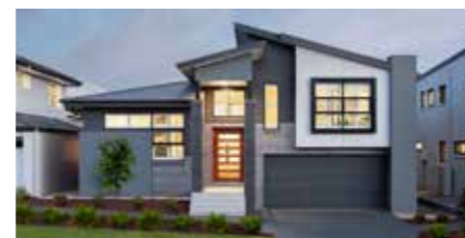
San Tropez 273