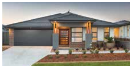
Monaco 1 211