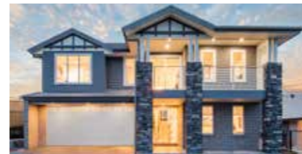
Riviera 1 267