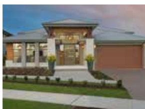
Carolina 1 302