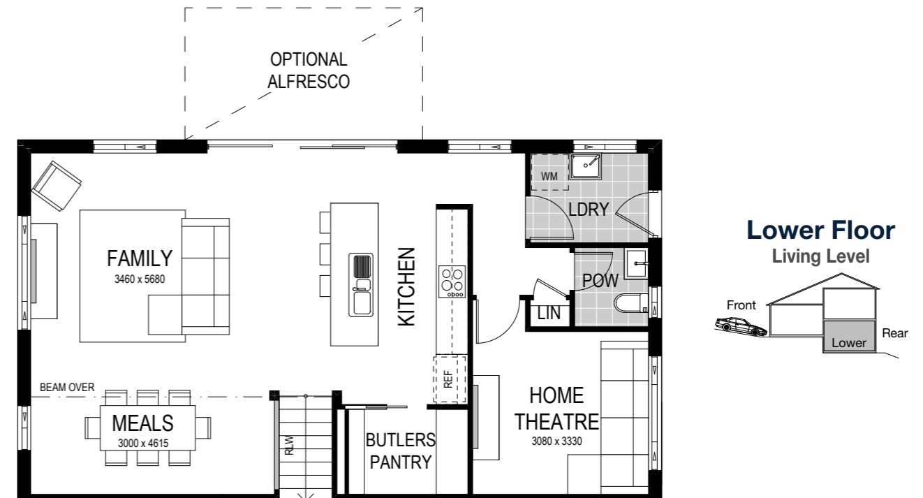
Scale: 1:100. Floor plan depicts Hamptons facade.