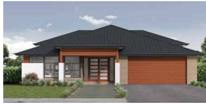
Executive Facade Roof Type Tiles Total m 2 /Sq 311.04/33.5