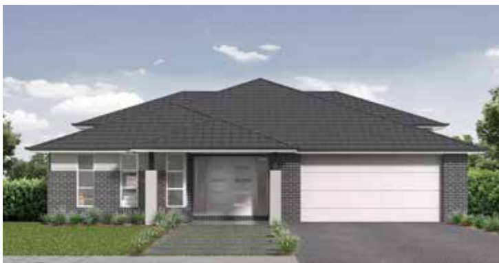
Cosmo Facade Roof Type Tiles Total m 2 /Sq 310.48/33.4