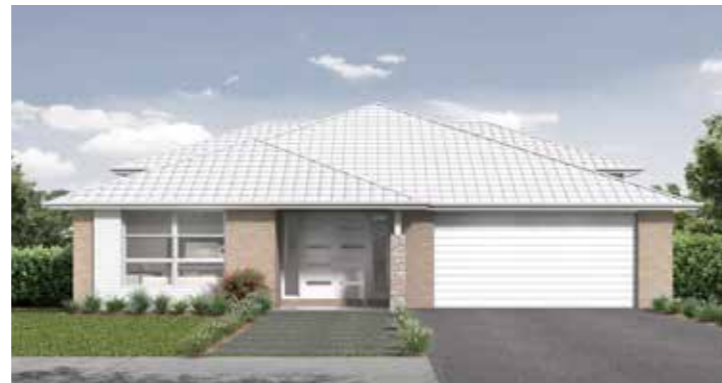
Metro Facade Roof Type Tiles Total m 2 /Sq 306.50/33.0