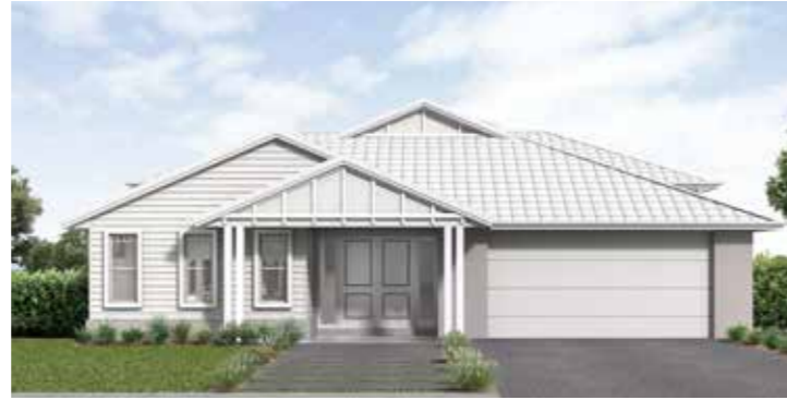
Hamptons Facade Roof Type Tiles Total m 2 /Sq 311.42/33.5