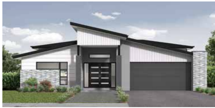
Retro Facade Roof Type Colorbond Total m 2 /Sq 309.88/33.4