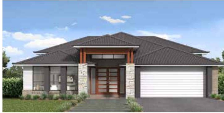
Grande Facade Roof Type Colorbond Total m 2 /Sq 310.56/33.4